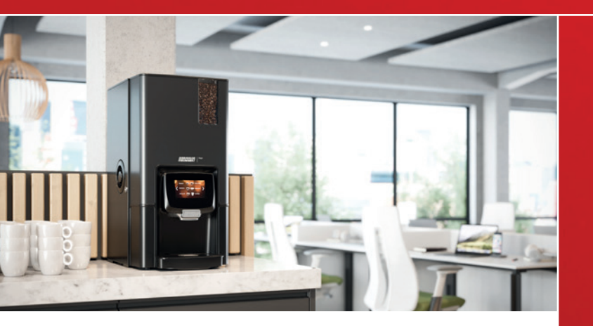
Your Bravilor Bonamat dealer

Please contact Bravilor Bonamat directly for more information.