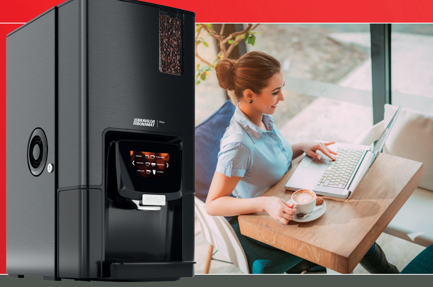
The taste of quality worldwide